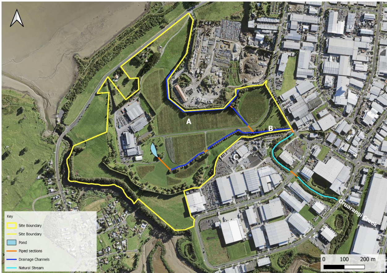
Figure 2. Freshwater features identified within the Villa Maria site.

Descriptions of the channel environments and habitat values have previously been detailed by Bioresarches and FSL 1,2 . Ecological values of the artificial channels were assessed as ‘low’ in both reports. We agree with this assessment, largely due to the modified nature of the channels for their intended drainage purposes, which provide poor quality aquatic habitat, limited flow, and are overgrown with exotic macrophytes (Figure 3).