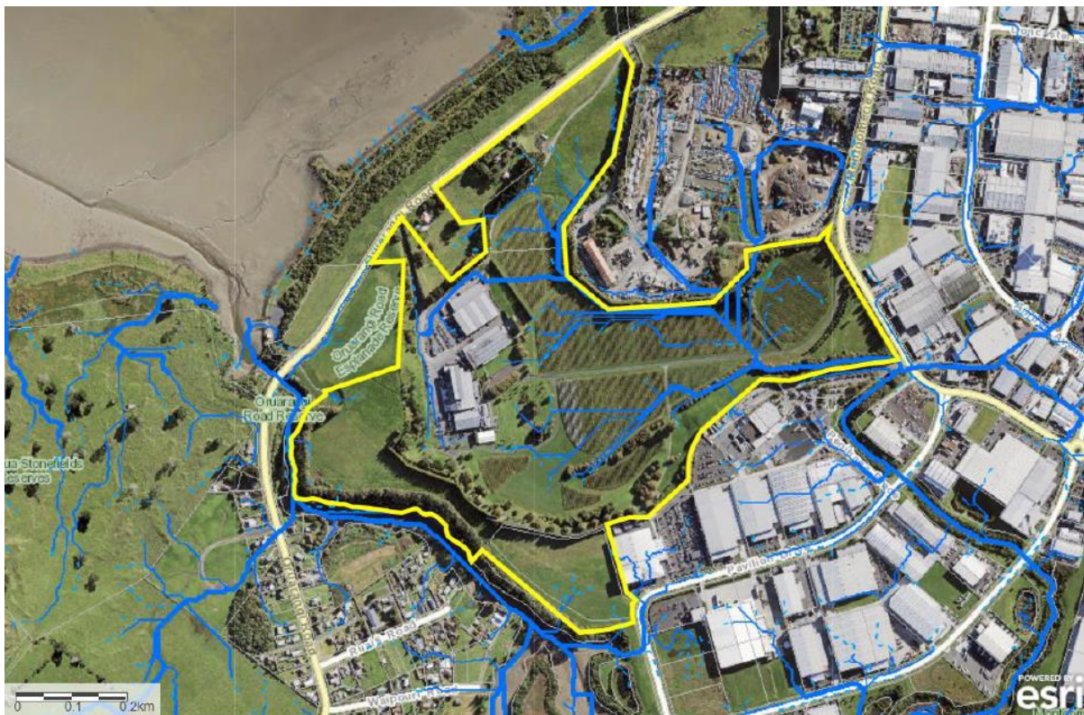
Figure 1. The site at Villa Maria Estate (yellow polygon) and Auckland Council's predicted overland flow paths overlay (blue lines).

This assessment may be used to inform resource consent requirements in accordance with the AUP, the National Policy Statement for Freshwater Management 2020 (NPS-FM) and the National Environmental Standards for Freshwater (NES-F).