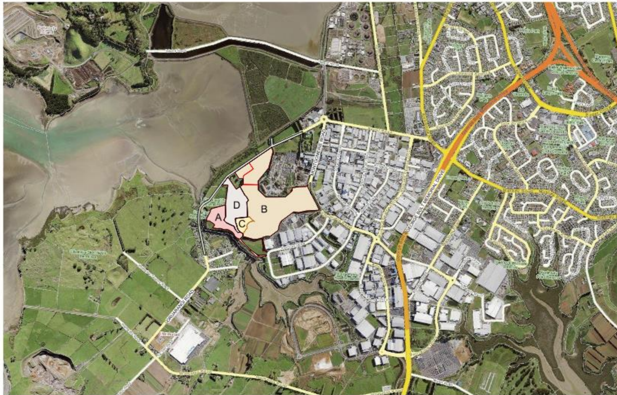
1 LOCATION PLAN 1 : 10000 A1 Plan