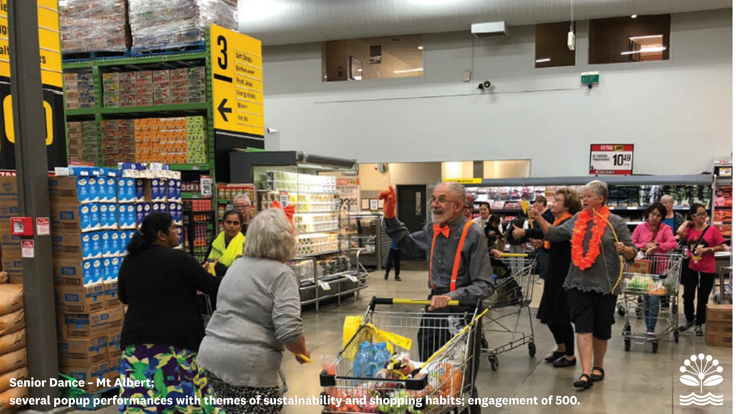
Senior Dance – Mt Albert; several popup performances with themes of sustainability and shopping habits; engagement of 500.