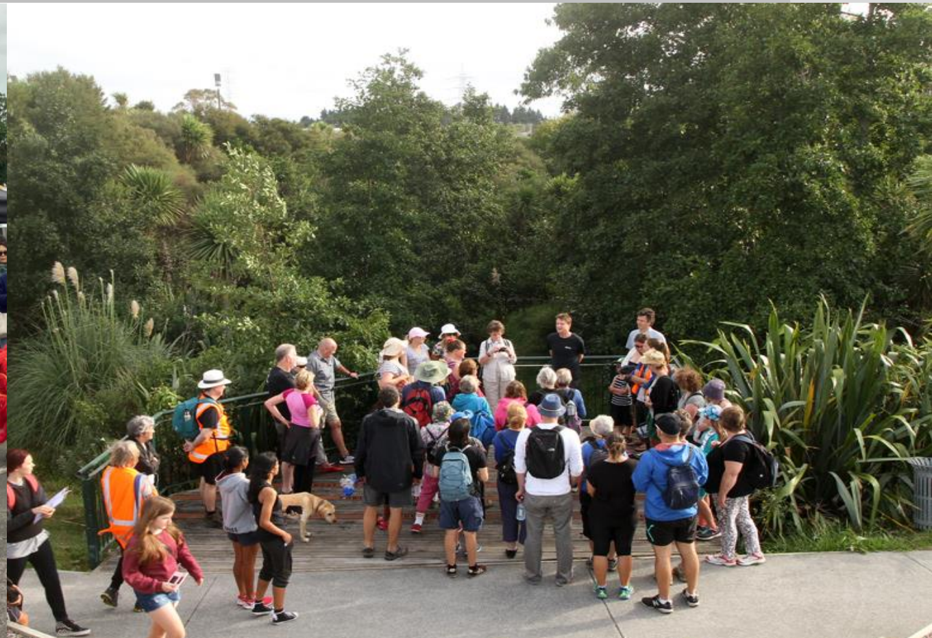
Eco matters walk, New Lynn pop up