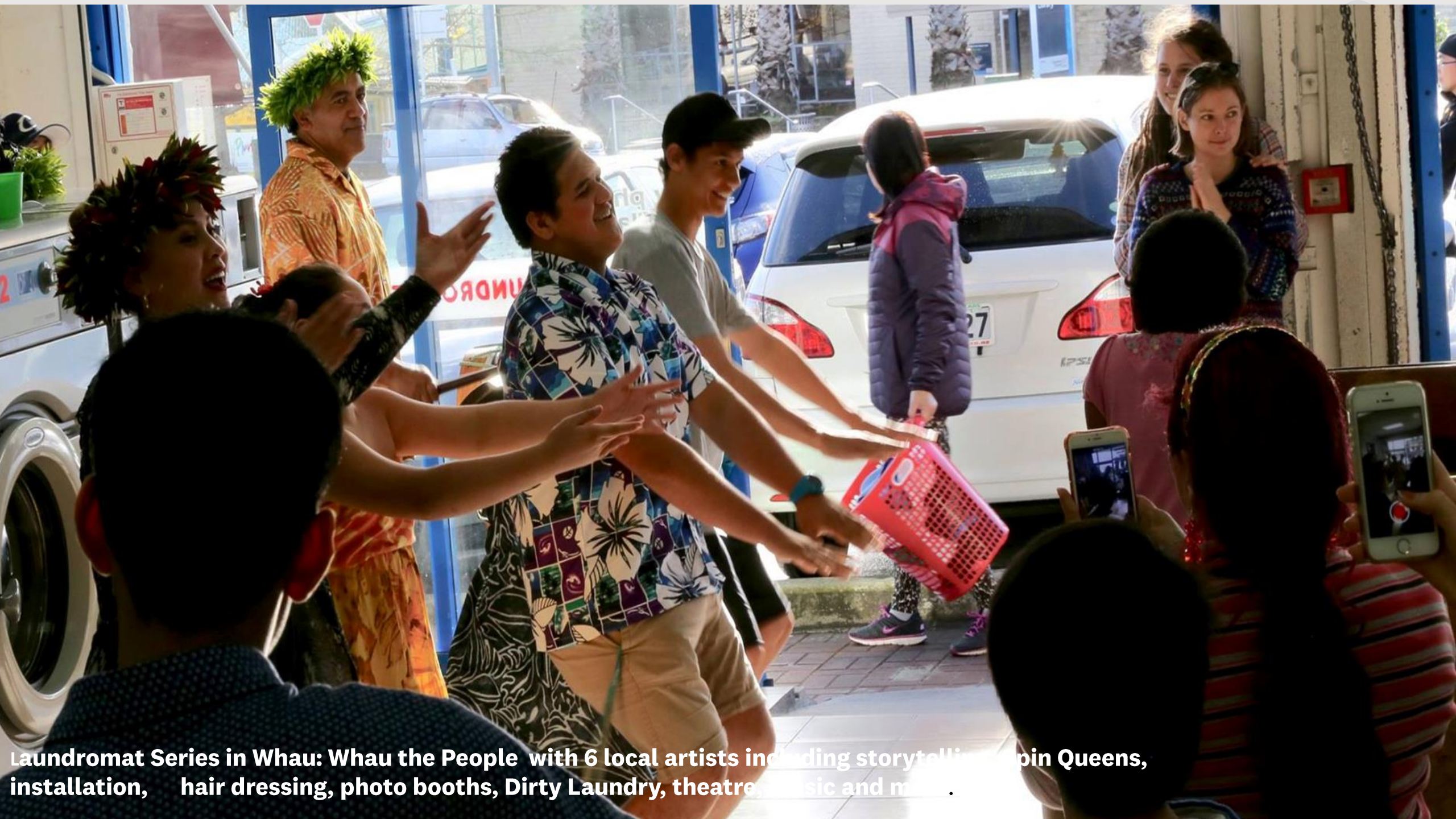
Laundromat Series in Whau: Whau the People with 6 local artists including storytelling, Spin Queens, installation, hair dressing, photo booths, Dirty Laundry, theatre, music and more.