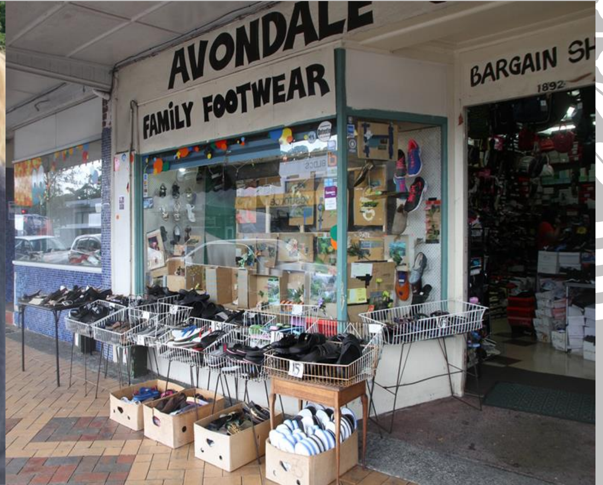
Whau, Shoe box artworks window display.