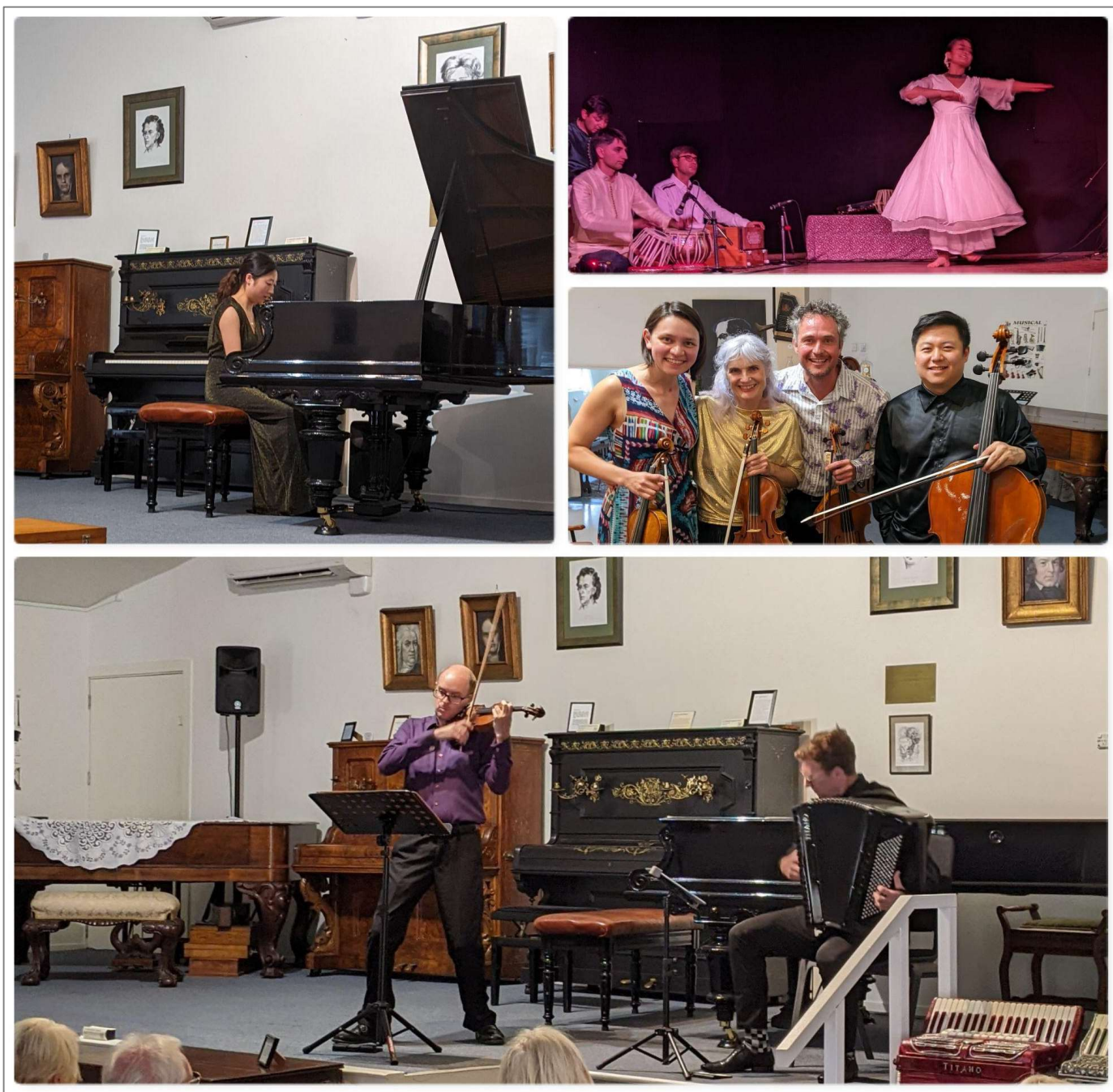
Some of our Live@Five concerts in the last year