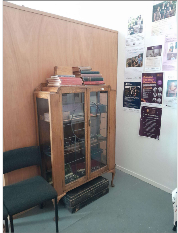
Kim Whitaker designed, built, and installed the new greenroom wall partition