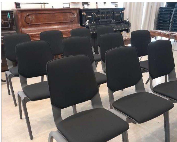
Our new flexible seating which can be stacked and interlocked