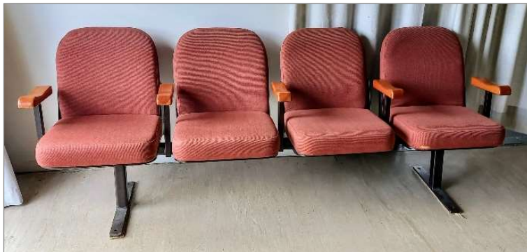
The original old chairs, once theatre seating

The new chairs were sourced from Alloyfold, a company that is owned by the Pathway Charitable Group. The products they sell fund affordable accommodation, employment and skills programmes, prisoner reintegration and social work in New Zealand.