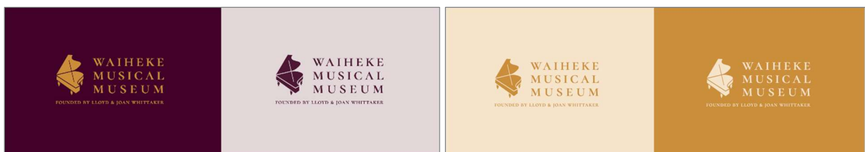
Colour options of our new logo

The Waiheke Local Board approved a grant which enabled us to fund a local graphic designer to create our new brand design. This has further helped with more efficient and time saving administration procedures. The feedback on our colours and new look has been very positive too.