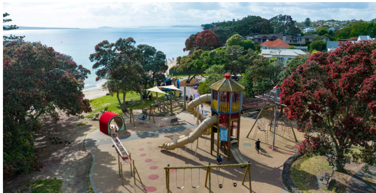
Gould Reserve Playground ▲

We officially opened the playground extension at Takapuna Beach Reserve in December 2023. The project was funded in partnership with generous local benefactors. The extension connects paths to new accessible barbeques and picnic tables with views onto the Hauraki Gulf and Rangitoto Island.