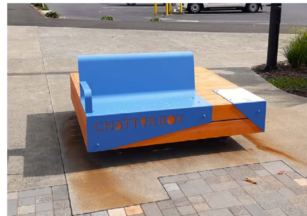
▶ The Chatterbox seat in Waiwharariki Anzac Square