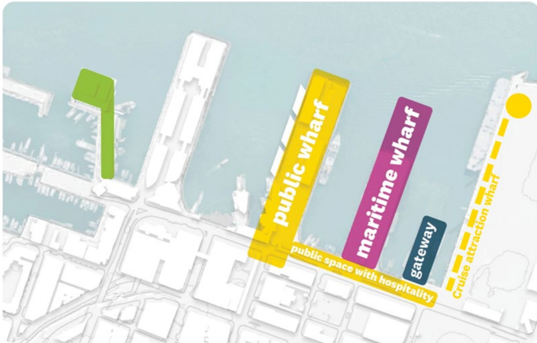
Excerpt from Framework Plan, with addition of shared access to part of Bledisloe Terminal