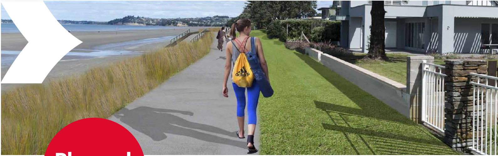
Concept image of proposed walkway (final design may vary)