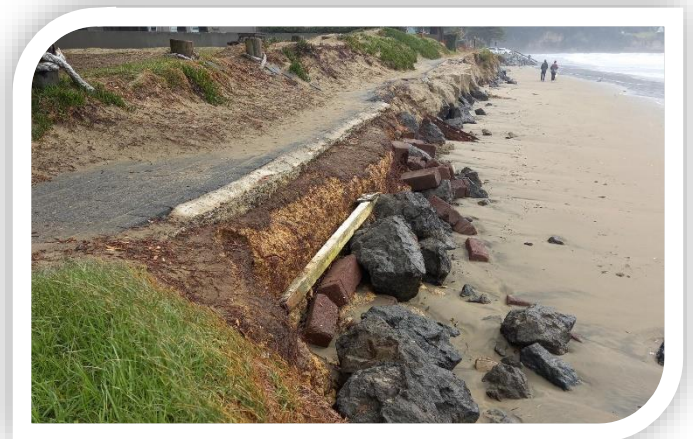
The existing walkway after a storm event

Ōrewa Reserve and the foreshore area adjacent to the Ōrewa Surf Lifesaving Club are not part of this project. Future development options for this section of the beach are being considered. Further engagement with the community will take place when technical assessments are complete and the costs and benefits of feasible options are known.