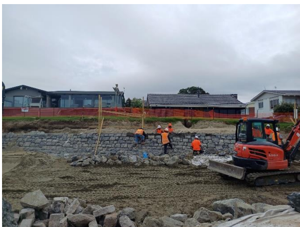
Section of seawall under construction, December 2024

Prior to Christmas JFC made good progress in a short space of time and completed two 30 metre sections of seawall. There are two stonemason crews constructing the wall, and each is working on a separate section.